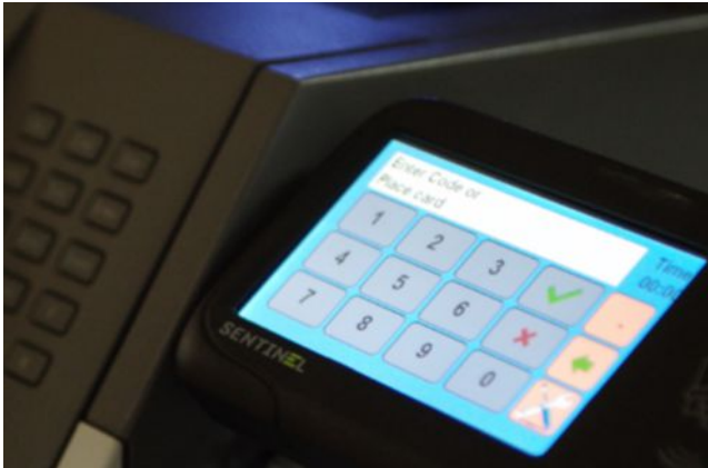
Sentinel Affixed to a Corporate Printer